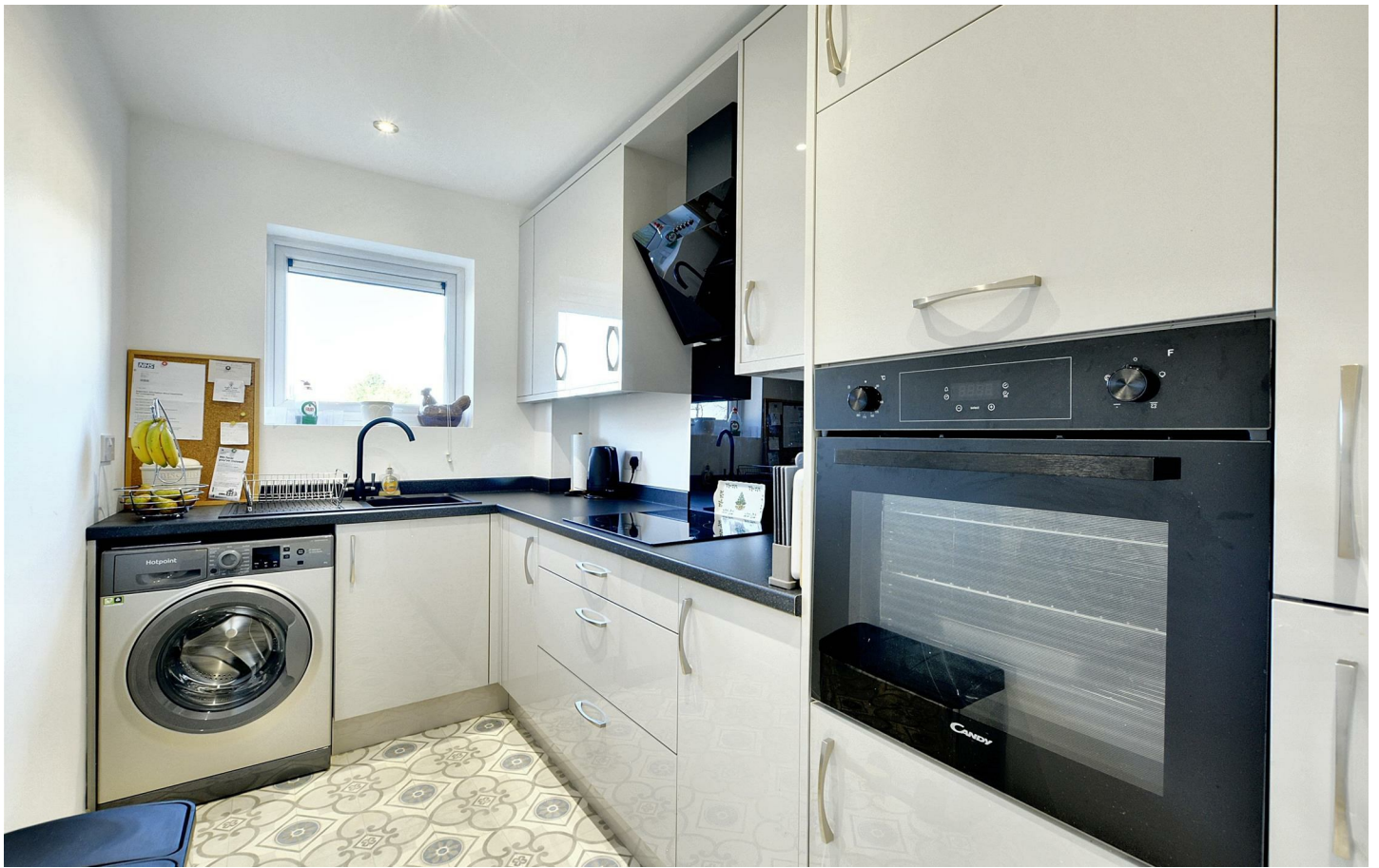
A recently renovated two bedroom second floor flat.

Situated in this purpose built development for the over 55's, sits this well presented and contemporary two bedroom flat that has been comprehensively renovated to a good standard throughout and now offers ready to move into accommodation.